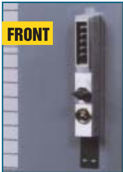
(CF-2) Five-Button Coded Access Lock ...allows code or key entry. Match with push paddle or thumb turn knob inside.