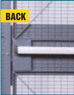
(CB-3) Push Bar... push bar runs full width of door. Match with key or five-digit push button lock.