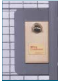
(SF-2) Thumb-Turn Latch...latches only, does not lock.