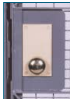
(SB-3) Door Knob... typical size door knob for easy exit.