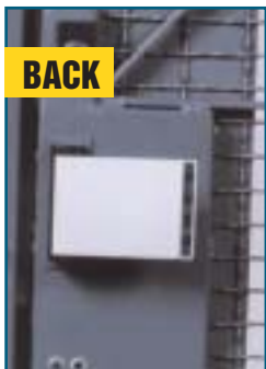
(CB-2) Push Paddle... hand-sized paddle for quick exit. Match with key or five-digit push button lock.