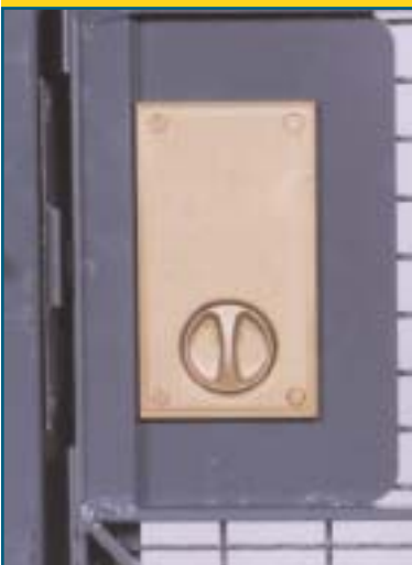
(SB-1) Recessed Thumb Turn Knob ... standard knob for partition lock.