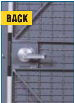
(CB-1) Master Lock® ADA Handle... meets ADA requirements, available with or without key. (Twist button lock shown)