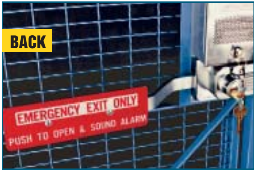
(CB-4) Alarm Lock... sounds battery powered alarm when opened. Available with or without exterior key access.