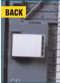
(CB-2) Push Paddle... hand-sized paddle for quick exit.