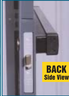
BACK Side View