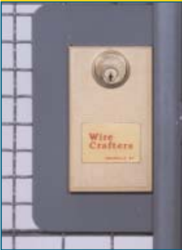
(SF-1) Key Lock. . . standard partition lock.