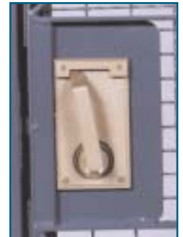
(SB-4) Lever Handle ...alternative to standard door knob. Meets ADA requirements.