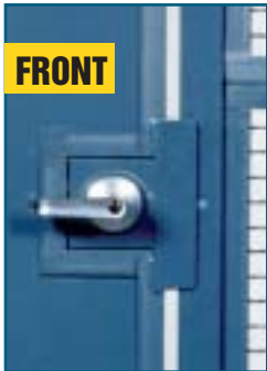
(CF-1) Master Lock® ADA Handle... meets ADA requirements, available with or without key lock. (Key Lock shown)