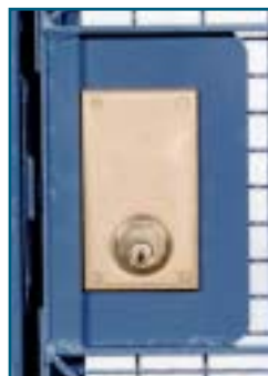
(SB-2) Interior Key ...lock from both sides, keyed to match face side.