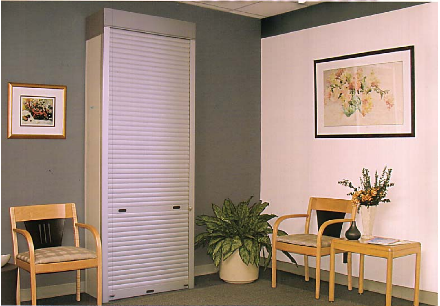
Photo of Quik-Roll is shown with the optional side closure panels.

Securing important documents or patient information to meet HIPAA compliance has never been easier.