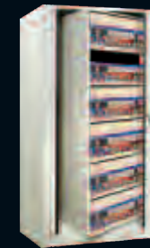
Ez2@ Rotary Action File