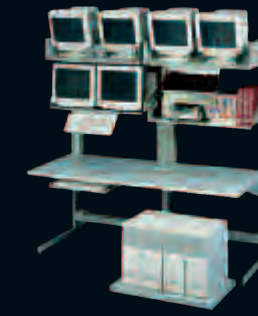
Technical Furniture Systems™