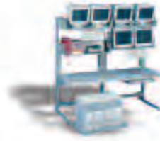
LAN & Security Systems