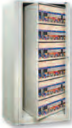
Ez2™ Rotary Action File

The Ez2™ offers up to 312%* more files per square foot than traditional filing systems!