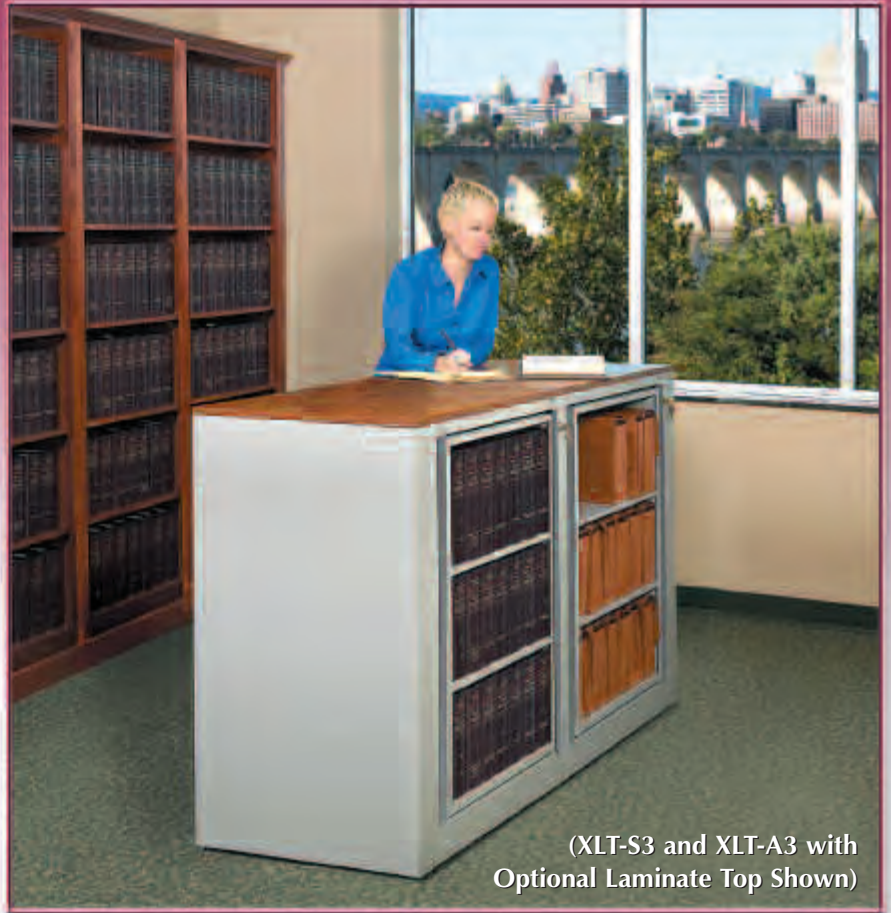
(XLT-S3 and XLT-A3 with Optional Laminate Top Shown)

The Ez2™ is a flexible and versatile storage solution. A three high unit can serve as a convenient work surface with storage underneath for common work areas. Multiple units can be joined together to double as storage and a room divider. The Ez2™ is perfect for any office application!