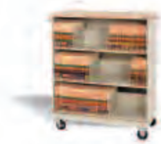
Specialty Filing & Storage