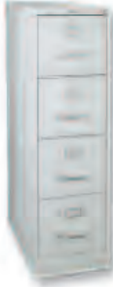
Vertical 4 Drawer