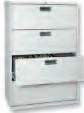
Lateral 4 Drawer