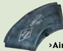
>Air Tire Tube<